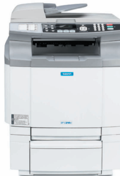
The Savin SP C210SF shown here with the optional 530-sheet paper tray.

Specifications subject to change without notice.